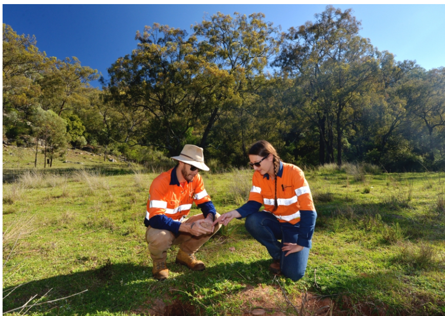
▲ Field inspection