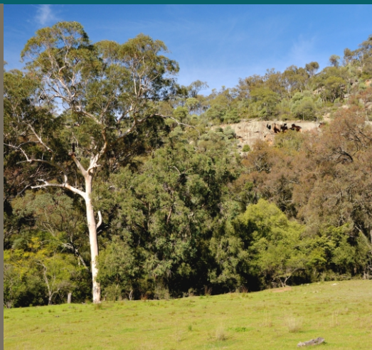
▲ Field inspection

⑪ Hours of operation have been limited to 7am to dusk weekdays. There is no plan to work on weekends or Public Holidays unless, by chance, drilling equipment needs to be retrieved due to difficult ground conditions. In this case the extended work period would need to be discussed and agreed upon with the landholder.